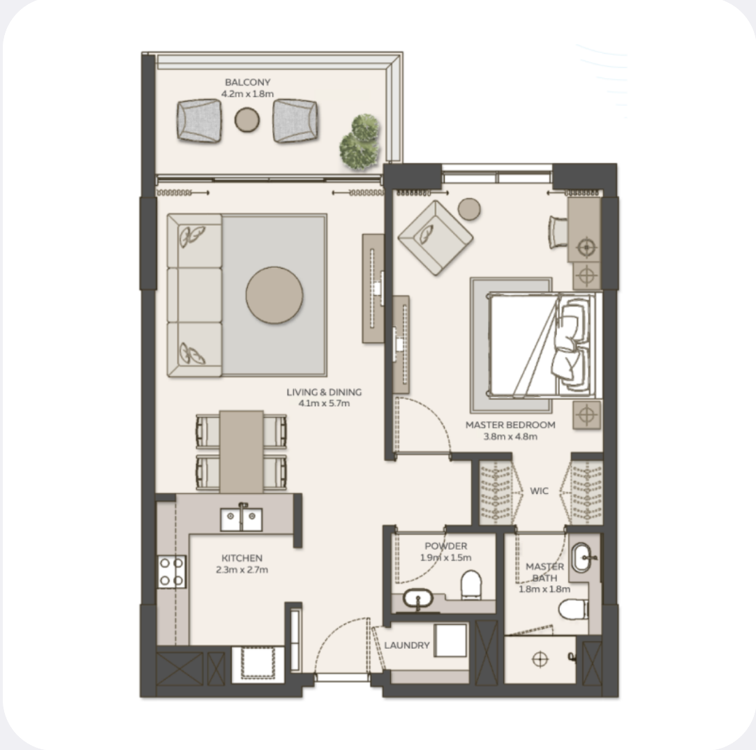
Apartments 1 bedroom

FROM AED 1,820,000 TO AED 1,960,000 958 sqft / 89 m 2 1101 sqft / 102 m 2