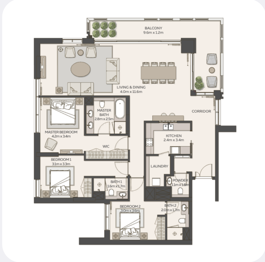
Apartments 3 bedroom

FROM AED 2,499,000 TO AED 2,984,000 1370 sqft / 127 m 2 1525 sqft / 142 m 2