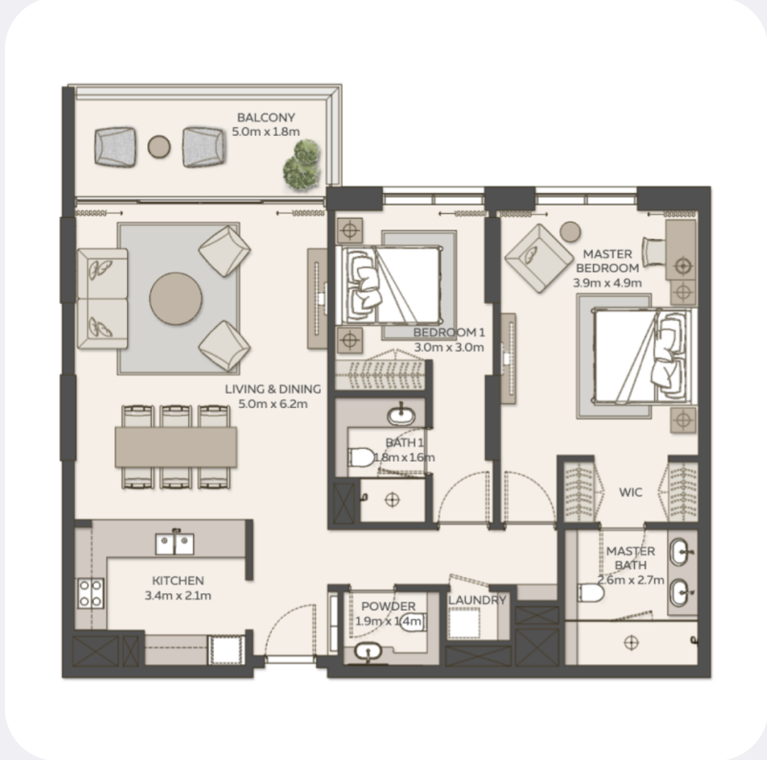
Apartments 2 bedroom

FROM AED 1,820,000 TO AED 1,960,000 958 sqft / 89 m 2 1101 sqft / 102 m 2